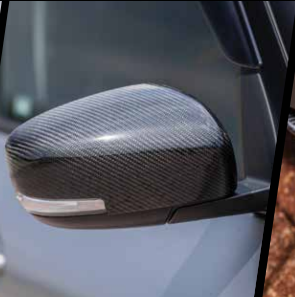
CARBON FIBRE SIDE MIRROR