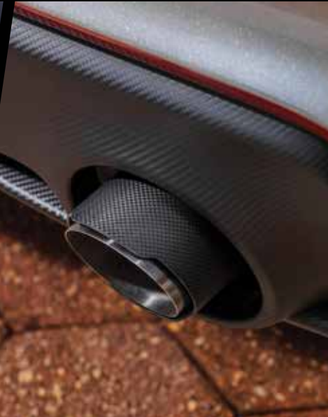
DUAL CARBON FIBRE EXHAUST TIPS