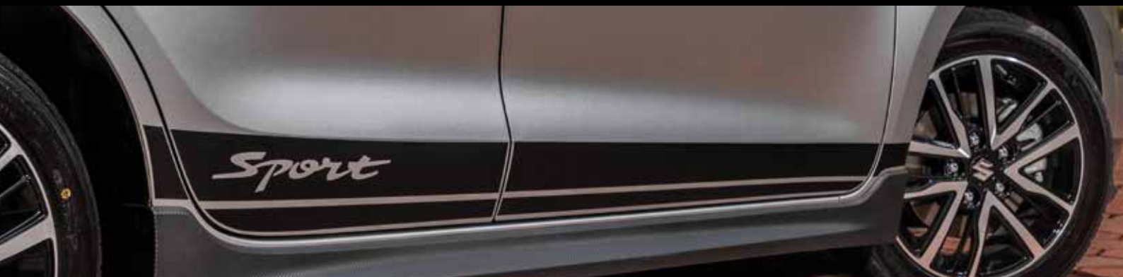
BLACK "SPORT" SIDE DECAL