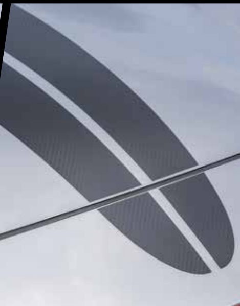
BLACK HOOD DECAL