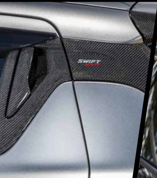
REAR CARBON FIBRE & DOOR HANDLE