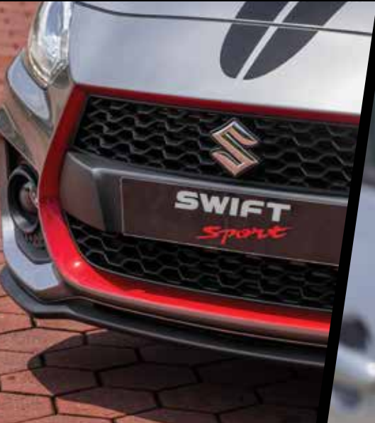
ADDITIONAL RED LINING

ELEVATE YOUR DRIVE, MAKE A STATEMENT, IN SILVER ELEGANCE