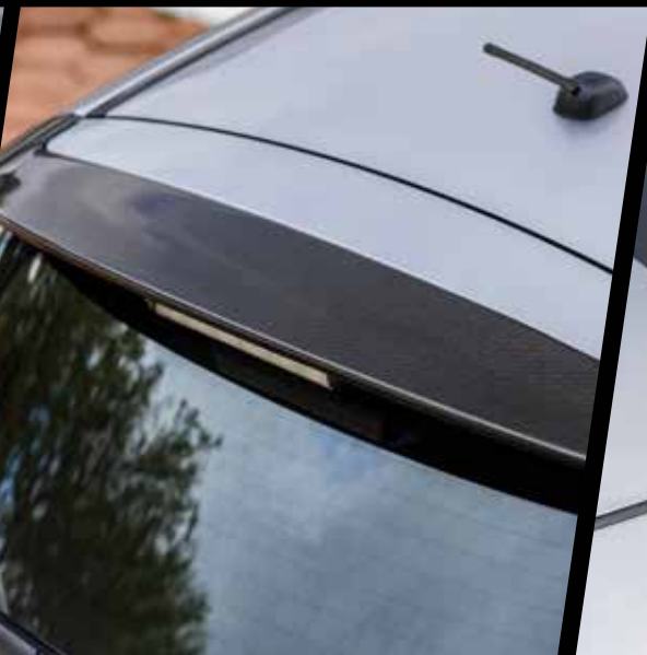
CARBON FIBRE SPOILER